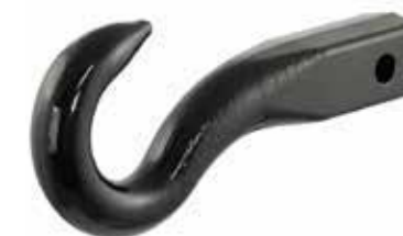
Forged Tow Hook