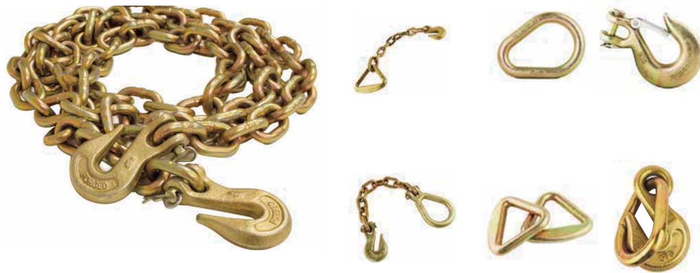
G70 Binder Chain & Accessories