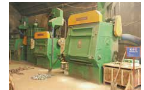
Shot Blasting Machine