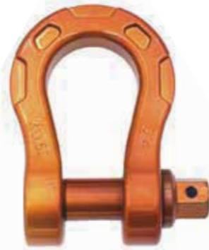
5T Aluminum Bow Shackle