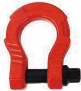
10T Square Mega Shackle+ Anti-theft pin