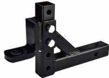
Adjustable Steel Ball Mount(Type II)