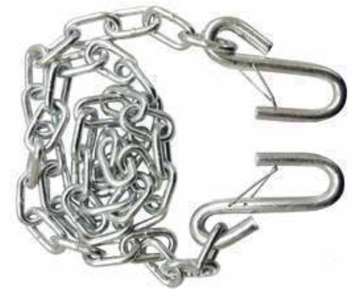
G30 Safety Chain