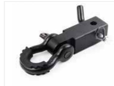
2" Shackle Hitch Receiver