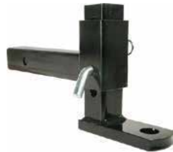
Adjustable Steel Ball Mount(Type I)