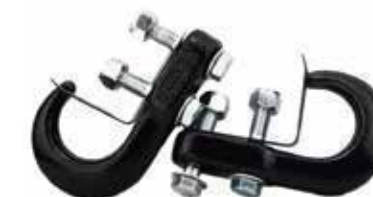
Tow Hook with Latch