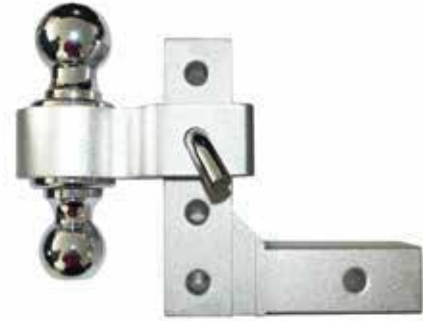
Adjustable Aluminum Ball Mount