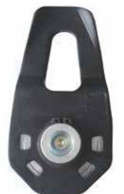
Steel Mega Snatch Block