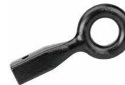
Forged Tow Eye