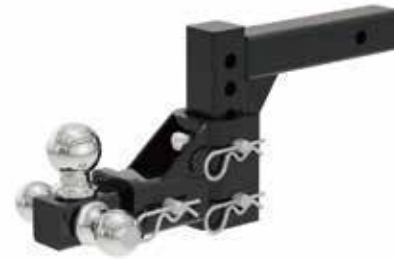
Adjustable Steel Triball Mount