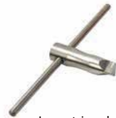
Inner triangle nut