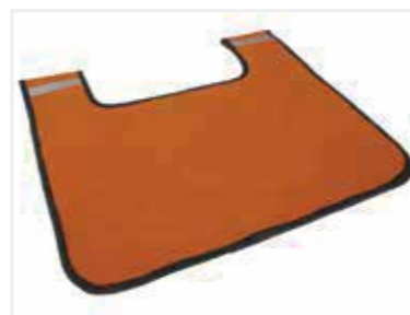
Winch Cable Dampener