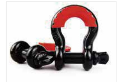
3/4" D Ring Shackle