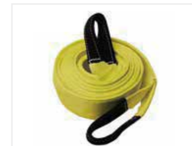
3"*30ft Tow Strap