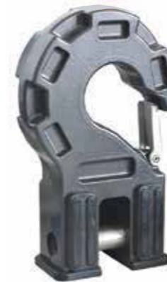
Aluminum Winch Hook