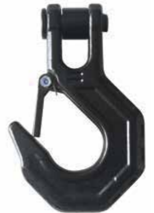
Custom Winch Hook