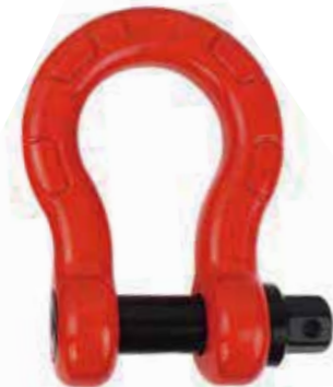
10T Round Mega Shackle+ Anti-theft pin