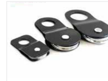
4T/8T/10T Snatch Block