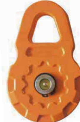
Custom Snatch Block