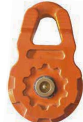
Aluminum Snatch Block