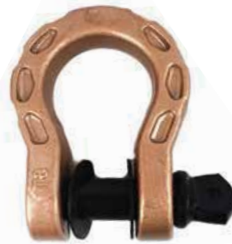
8T Mega Bow Shackle